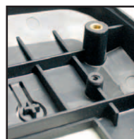
Structural ribs minimize flexing and gives strength to the housing, T31P