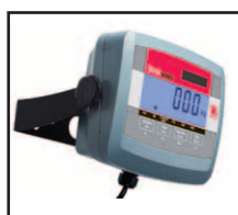
T31P Indicator shown with optional wall mount bracket