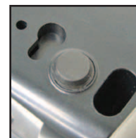
Integrated key-hole mounts for wall mounting without brackets, T31P