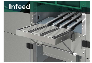
•Gravity infeed roller