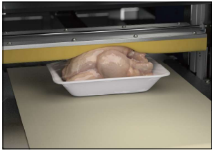
Tray presser with enhanced heater conveyor for secure sealing

The W-5600CPR11 remarkably improves the efficiency of your wrapping operation with speeds up to 30 packages/min.