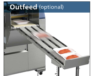
•Gravity outfeed roller