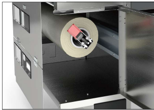
Quick, simple film loading using the new mechanism